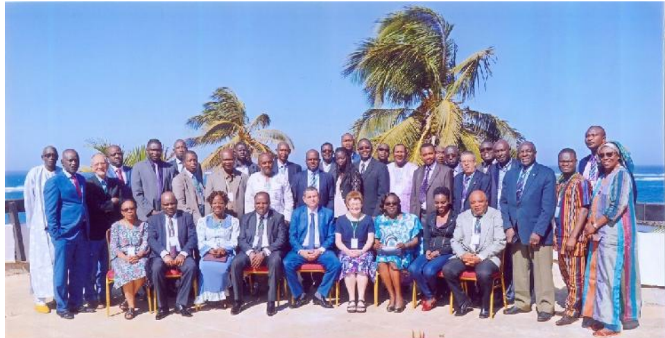
PIC: GROUP PHOTOGRAPHS AFTER THE OPENING CEREMONY OF THE ANNUAL MEETING OF MEMBERS OF THE REGIONAL ADVISORY COMMITTEE OF WAHO-IDRC DAKAR 15-17/02/2016

To finalize the meeting process and chart a part way for what lies ahead, each research team, again, was asked to draw up an action/activity plan for the remaining period of the project.