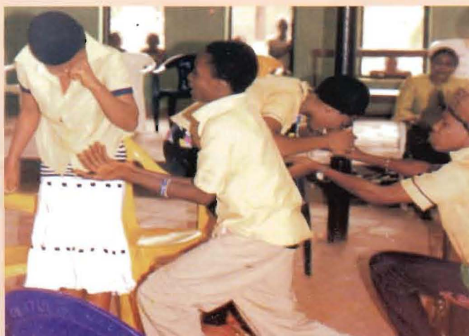
In-school Youth during their drama presentation

Also there was Drama presentations from the in-school youth and out- of- school youth, jokes on HIV/AIDS; STDS were added to spice up the workshop. In all a total of 116 persons were reached, this comprises of 40 out school youth in attendance and 56 in-school youth and about 20 elders.