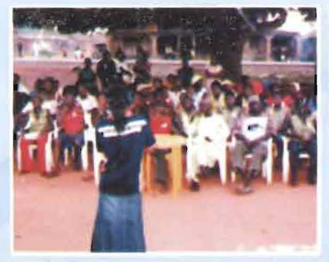
A Youth Corps Member having a talk community with community members

Specifically the core group members have been empowered with factual information on the knowledge of HIV/AIDS, and Sexual Health and Rights.