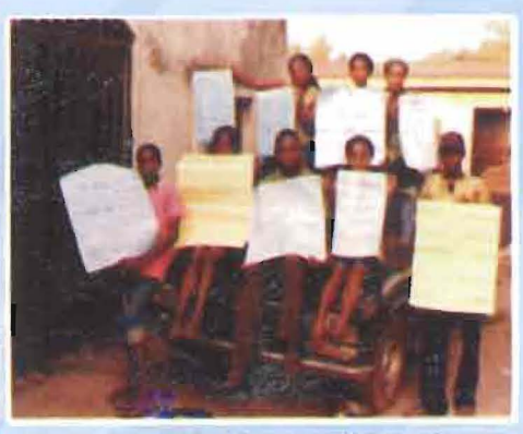
Youth Corp Members with Members of their Core Groups displaying inscriptions

The activities that Youth Corp Members have engaged in includes: organization of peerled activities, which have led to members of their core groups taking over the moderation of programmes like seminars, talk shows, organized for community members.