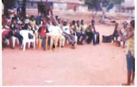
A trained core group member speaking out to members of the community

Youth in the community have been made to think critically about ways to prevent and pass on the message of HIV/AIDS, this they have done by drama presentations, football competition, debate, quiz competition, and talk shows.